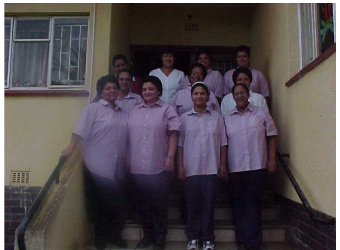
Elim Home staff in their new blouses donated by McDonalds through the GreaterGood South Africa Trust.

Alternatively, we are also registered on www.GreaterGoodSA.co.za where you can read more about our work and also make a credit card donation, donate loyalty points (including eBucks and American Express MR Points), identify volunteer opportunities or even make a donation in kind.